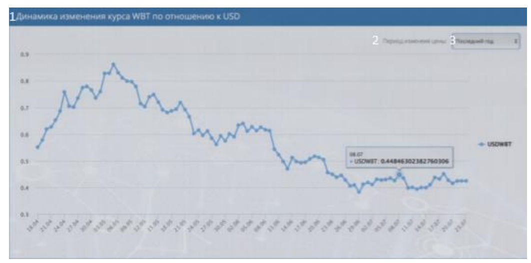
WBT course dynamics

As for the best time to invest, it is difficult to predict when it is best to make a purchase in the cryptocurrency market, so the Company recommends making regular investments in the WBT index. Thus, a customer always has the opportunity to buy assets at a lower price and get the largest number of assets.